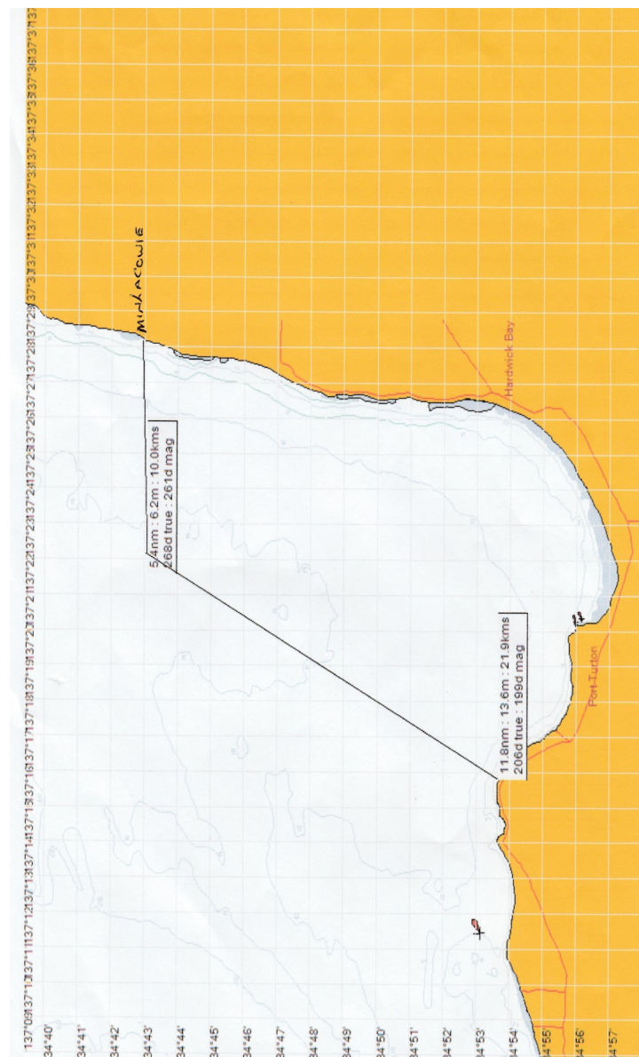
HARDWICKE BAY & DISTRICTS PROGRESS ASSC INC

Community Hall 5 Progress Road, Hardwicke Bay SA 5575 Email: progress@hardwickebay.org